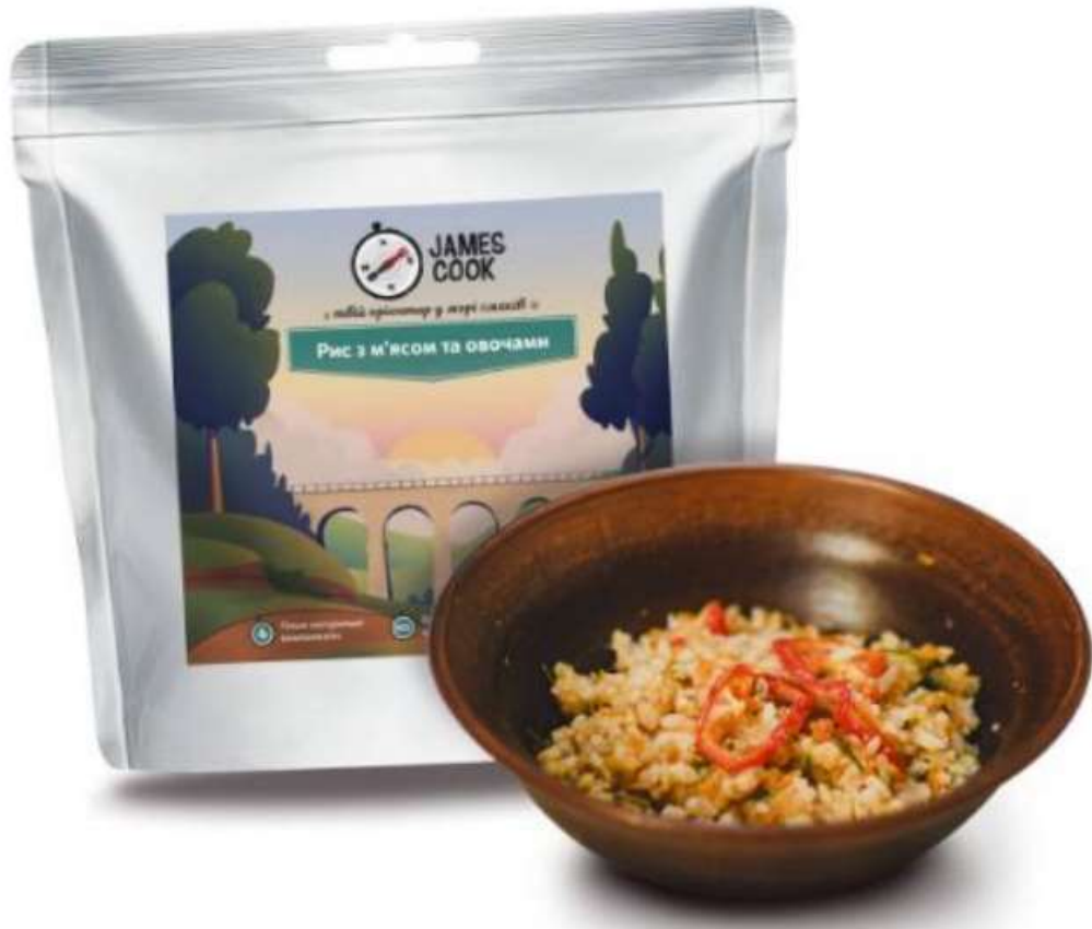
Figure 6. Freeze-dried food for hiking

The tour price includes breakfast, lunch and dinner. The food will be quite high in calories, healthy, varied and tasty (special dried and freeze-dried food for hiking) (Fig. 6).