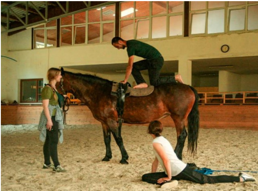
Figure 3. Horse yoga

As for approaches to the rehabilitation of military personnel after captivity and injury, they differ. In the first option, attention is focused on the emotional state of a person. Military personnel have great opportunity to occupy, socialize, pet and clean horses. The second option focuses on exercise but also includes animal cuddling. Hippotherapy promotes the development of such personality qualities as attention, responsiveness, overcoming fear, getting rid of attacks of aggression, excitability of the nervous system, isolation and depression.