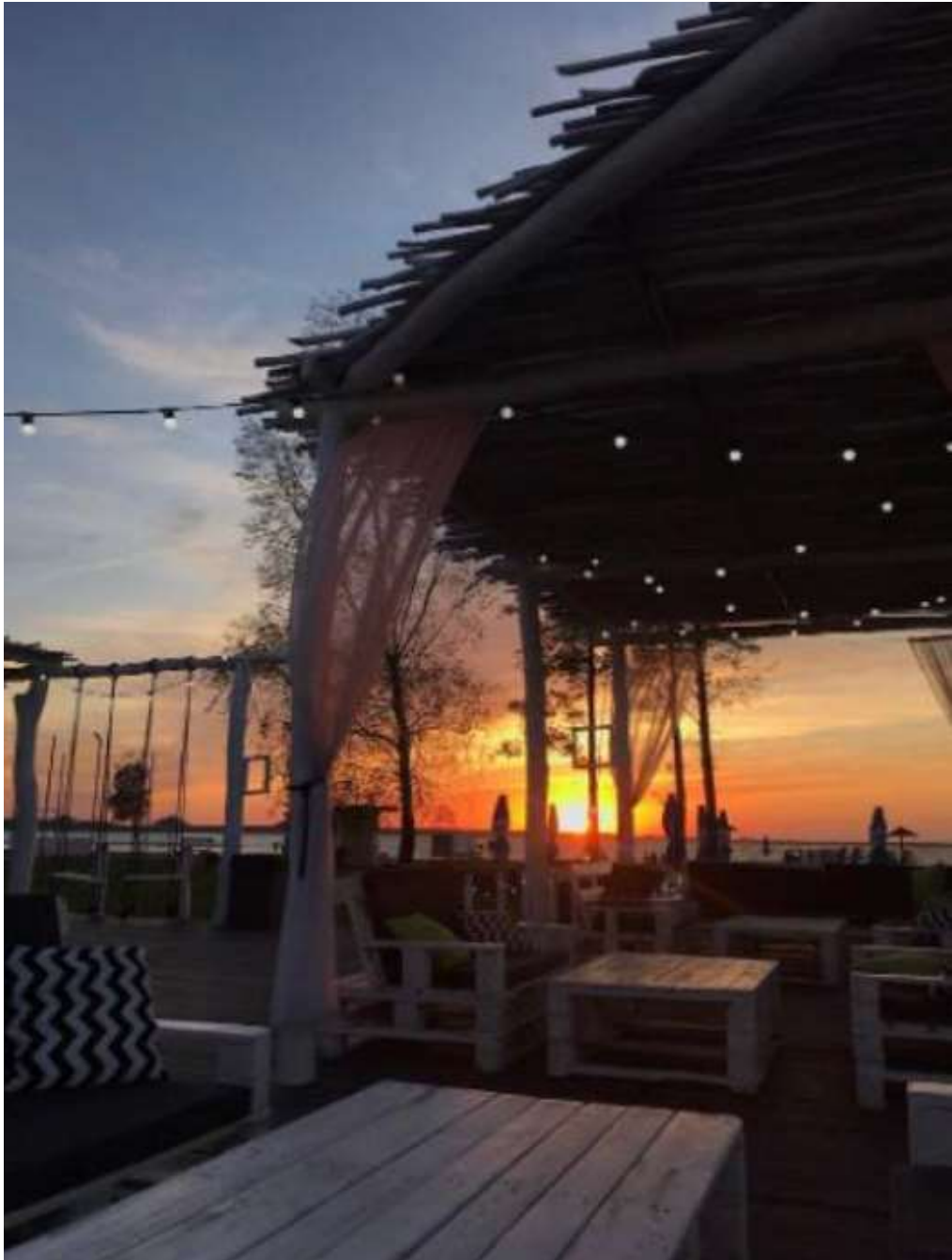
Figure 5. Final dinner on the shore of Lake Svityaz at the Amigos cafe