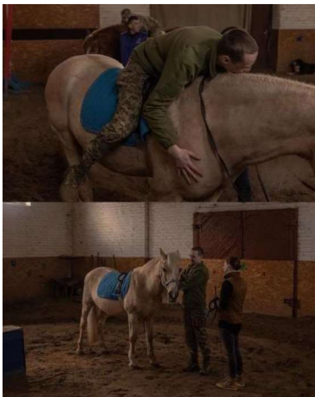
Figure2. Hippotherapy – rehabilitation for the military in Ukraine

Today, the war continues in Ukraine and therapeutic horse riding – hippotherapy – is becoming very popular. This type of therapy, carried out on horseback under the supervision of a special hippotherapist or a well-trained riding instructor, is more relevant today than ever, so we focus on the development of hippotherapy. This therapy is unique in its simultaneous positive physical, mental and emotional effects on patients with neurological, mental, physical and other serious illnesses. The essence of this therapy: riding puts a good load on all muscle groups, encouraging them to alternately contract and relax. Lost skills are gradually improved or restored as function declines. Balance and body shape also improve, coordination develops, and the activity helps achieve emotional stability.